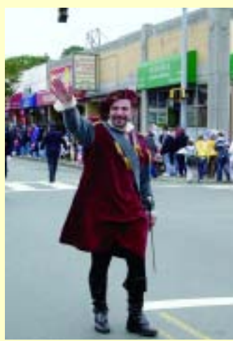
Columbus Day Parade

Our neighborhoods contain fine parks, committed volunteer groups and stable homes maintained by working families. Our people have a strong sense of community and are quick to welcome visitors as though long-time friends. We take pride in our past even as we look forward to a better tomorrow. We invite you to come and stay a while; we know you won't be disappointed.