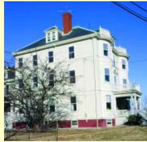
Revere Society for Cultural & Historic Preservation