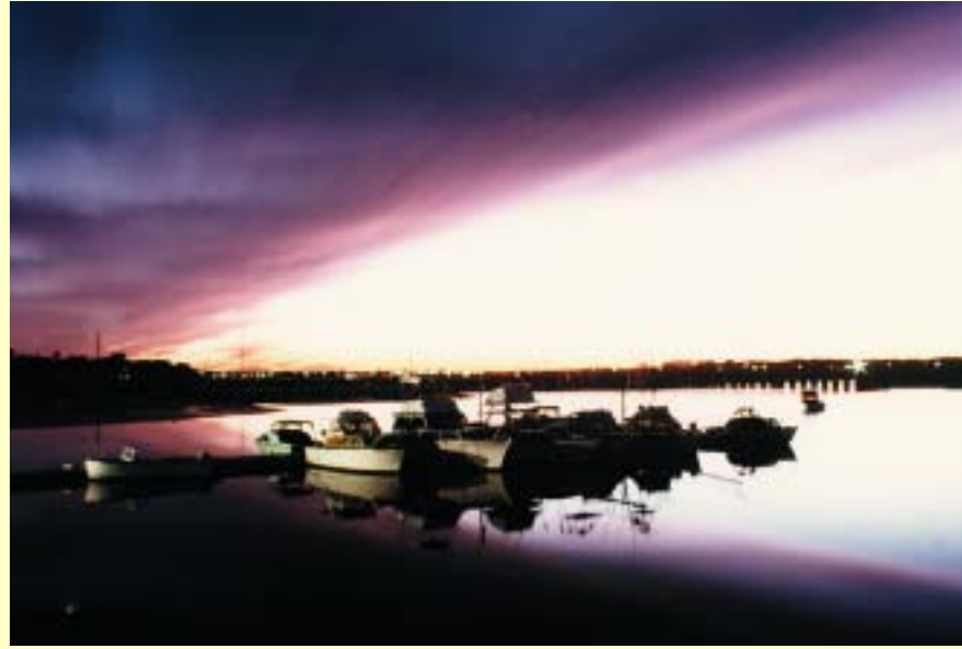
Along the Pines River