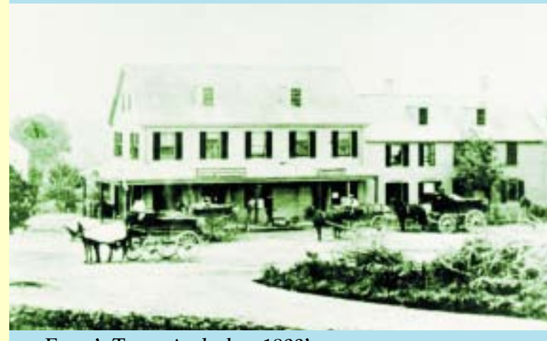
Fenno's Tavern in the late 1800's